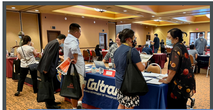
JOB OPPORTUNITIES: Attendees approach Caltrans to seek more information about the job positions that they are hiring for.

O n Friday, August 12, 2022, AAEDE hosted the 11th annual Job and Career Fair at the Almansor Court in Alhambra, CA. With a total of 80 different companies, the vendors met around 500 attendees that were interested in the employment positions that they had to offer. The variety of job opportunities were ranging from financial firms, eCommerce-based companies, and health care organizations, to security services, and transits. To mention a few, some companies that were in attendance were: the Walt Disney Company, Amazon, Louis Vuitton U.S. Manufacturing, Caltech, Home Depot, and Bazic Products.