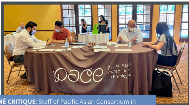
RÉSUMÉ CRITIQUE: Staff of Pacific Asian Consortium in Employment assist attendees in revising their résumés.

D uring the entirety of the event, the résumé critique workshop was offered to provide attendees with insight into creating a concise, effective résumé. They were given access to numerous laptops, where they could make last-minute updates and revisions to their résumés. Each attendee was met by an individual well-versed in writing, where they would be given time to have in-depth discussions about the content. After the résumés are refined, the attendees were brought to the printing station, where they could present physical copies to the companies they meet later on in the event.