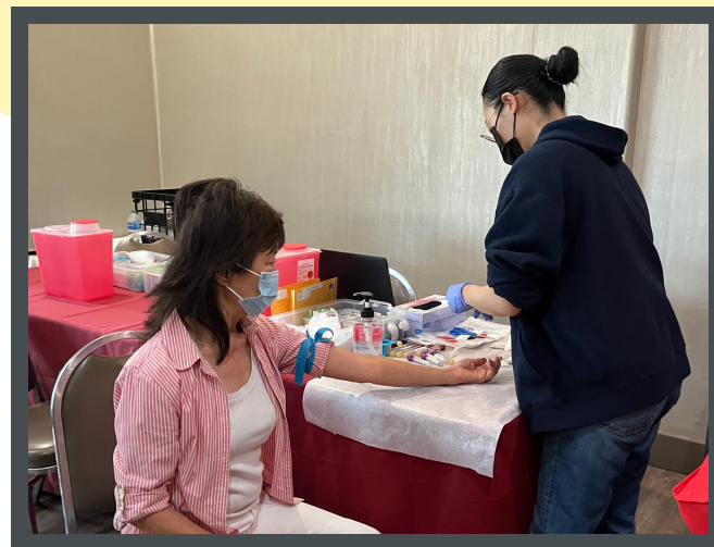
PROVIDING SERVICES: Attendee (left) is being instructed by the medical staff (right) to hold her arm out in preparation for a blood test

O n Friday, July 23, 2022, AAEDE hosted their first-ever Healthcare Career & Expo Fair at the Almansor Court in Alhambra, CA. The event was composed of 77 different healthcare companies, 32 of which offered job opportunities in the medical field located in the Salon room, 12 companies offering health services in Palm Court, and 33 other companies that offered both health services and resources in the Lakeview room. Some free healthcare services that were offered at the event includes: On-site covid vaccinations, oral screening, hearing screening, ear cleaning, blood pressure screening, lung capacity screening, glucose screening, BMI Screening, bone density screening, Hep B Screening, foot washing, manicures, and even haircuts. The event generated an ample turnout, with over 400 people attending.